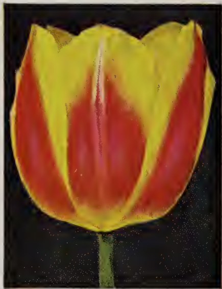
SINGLE EARLY TULIP KEIZERSKROON